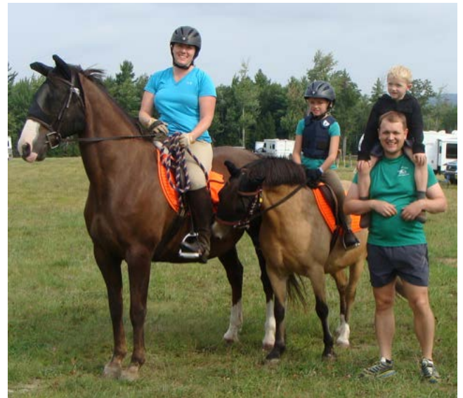
Fink family camping, riding and hiking