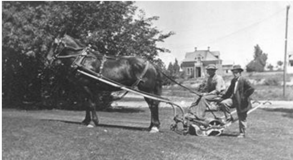
The latest thing. A horse drawn lawnmower.