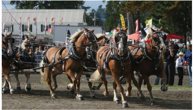
At the Freyburg Fair