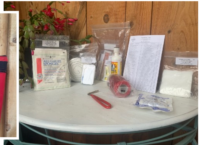
ITEM 12 Equine First Aid kit in handy carry bag